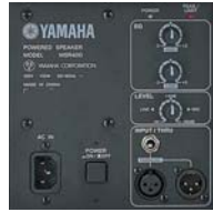
MSR400 Rear Panel