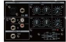
MSR250 Rear Panel

All-in-one sound solutions that are powerful, versatile, and reliable.