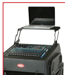
1SKB-AV8 Scissor Shelf