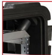
Corner elastomer shock mounts