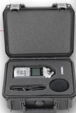
3i0907-4B-01 iSeries Zoom H4N Recorder Case

SKB iSeries waterproof hard case with custom cut ELE foam that includes pockets for the recorder, power supply, wind screens, memory cards and other accessories.