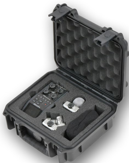
3i-0907-4-H6 iSeries Zoom H6 Recorder Case