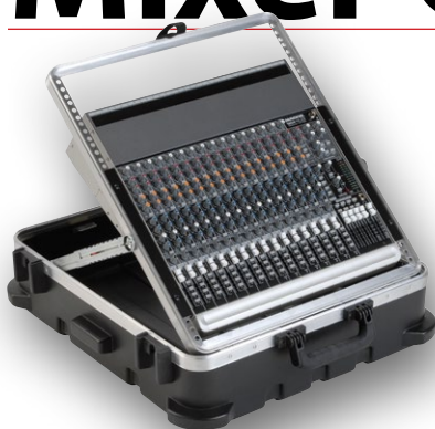
1SKB19-P12 12U Pop-Up Mixer case