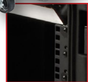
Square rack mounting holes on 28" deep rack versions