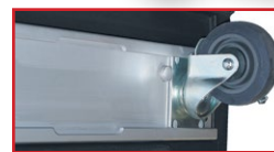
4" Removeable casters on Aluminum plate