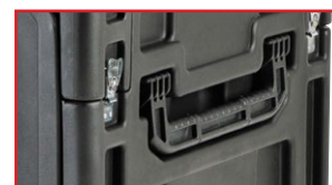
2 extra-long injection molded handles for two hand lifting