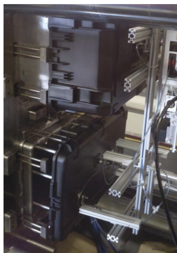
One of our Injection Molders in action