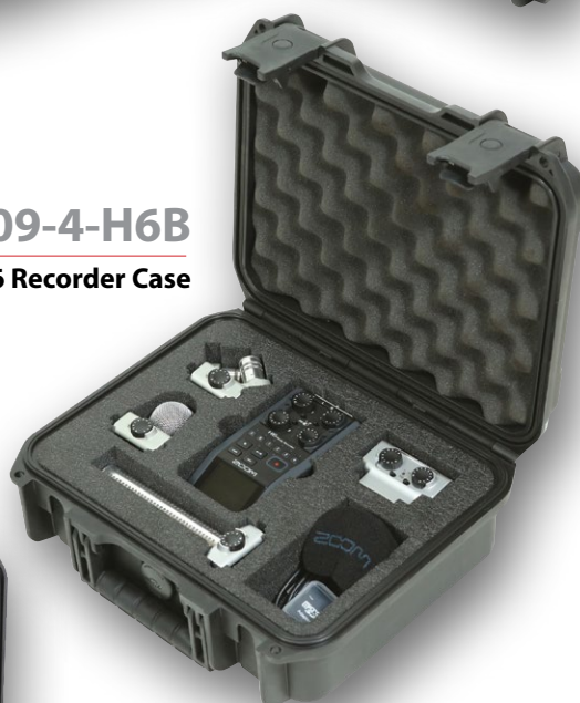
3i-1209-4-H6B iSeries Zoom H6 Recorder Case