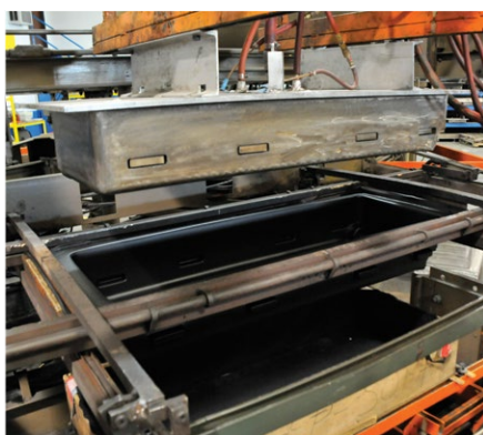
Pictured: Vacuum mold for keyboard case.

In 1997, SKB invested in roto-mold machinery. These molds are ideal for making larger cases and cylindrical cases. The PE roto-mold material starts as a fine powder that is measured according to the size of the case. The material is then sealed up in a multi-piece aluminum mold and fixed on a biaxial rotating wheel. The material is heated at 800 degrees in a very large oven while constantly rotating. The powder melts and coats the inside of the mold and after cooling, the cast is disassembled and the case is removed. Roto-Molding is great for providing maximum protection and can withstand maximum impact in transport.