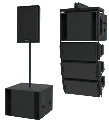
LS18 shown pole-mounting a PS15 cabinet (left) and flown in a GEO S12 line array (right).

Light and easy-to-handle, the LS18 uses a single 18" long excursion driver and is compatible with all GEO S12 accessories, so it can fly with the S1230 and S1210 line array modules, or anchor a ground stack of S12 cabinets. With a steel stand fitting on top of the cabinet, the LS18 also allows for pole mounting of GEO S12 cabinets or NEXO PS15-R2 full-range speakers. LS18 can be flown in tandem with PS15s, which will be of particular interest to the installation sector.