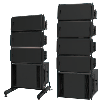
LS18 anchoring a GEO S12 ground stack.